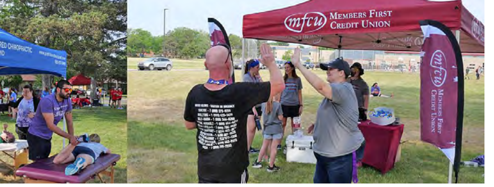
Interested in Race Sponsorship? Visit GREATERMIDLAND.ORG/RACE-SPONSORSHIP